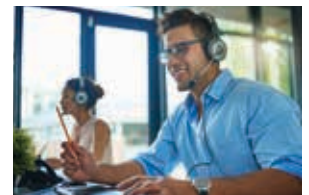
Improve indoor air quality