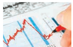
Reduce energy costs