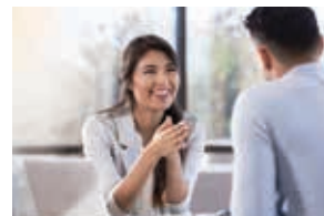
Improve workplace comfort