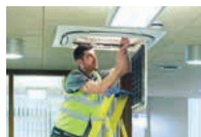
Reduce maintenance and repair costs