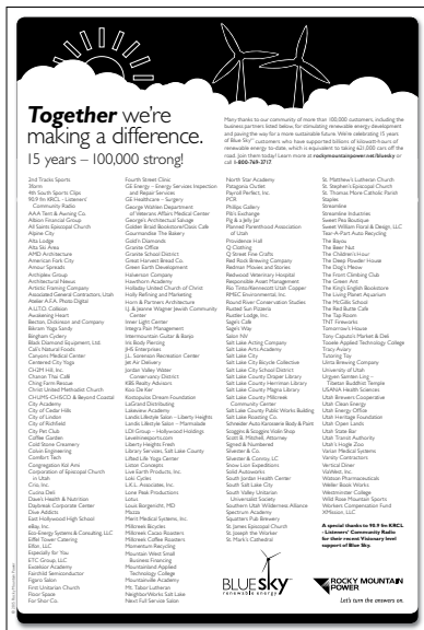
Business Partner ad