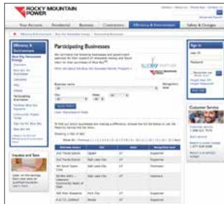
Online Business Partner listing