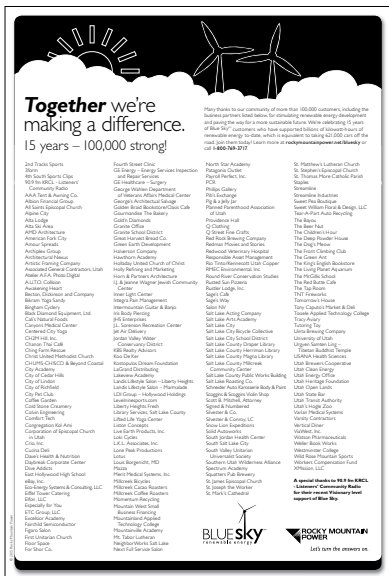
Business Partner ad