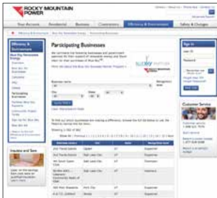
Online Business Partner listing