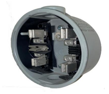
Figure 2. Ganged Meter Sockets