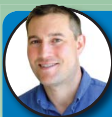
Powered by Jeff Hymas External Communications

up to give a fixed amount each month on their electric bills. For more information on giving, call us toll free at 1-888-221-7070.