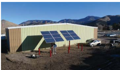
Blue Sky customers' support helped build this solar project in Lava Hot Springs.