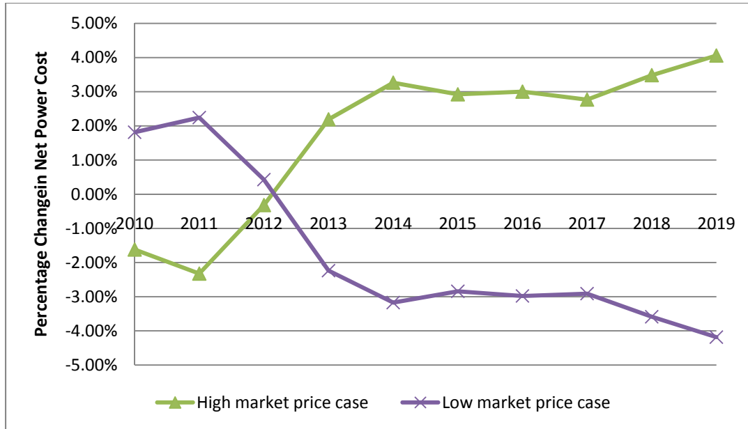
Chart 1 High and Low Price Studies Compared to Base NPC Study