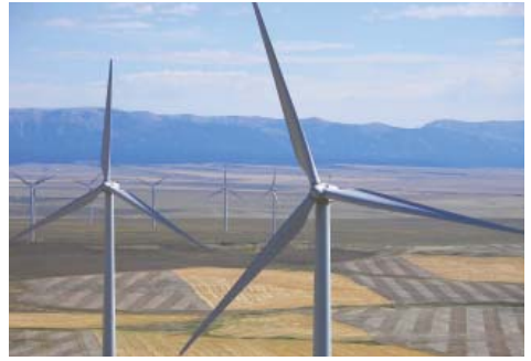
Judith Gap wind project, Harlowton, Montana

Rocky Mountain Power's Blue Sky green power option is Green-e Energy Certified, meeting environmental and consumer protection standards established by the Center for Resource Solutions. Blue Sky and other Green-e Energy Certified products are audited annually to ensure