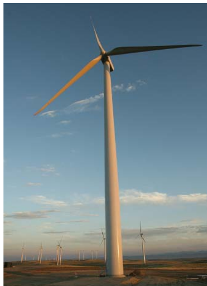
Glenrock wind project, Glenrock, Wyoming

In addition, through our Green-e Energy Certified Blue Sky SM renewable energy program, we offer customers the opportunity to support new renewable resources