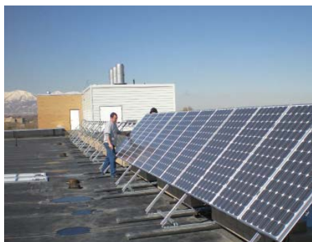
Salt Lake Community College solar array

Blue Sky is Green-e Energy Certified, meeting national environmental and consumer protection standards.