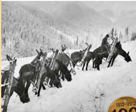
Mules carry supplies needed to build early distribution lines.

It is 1912. A gallon of gas costs 7 cents. Each week millions of people flock to the cinema to watch silent film star Mary Pickford.